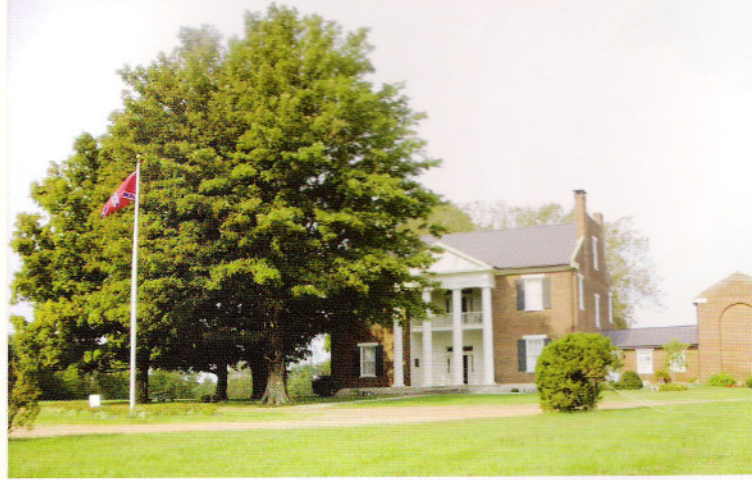
Elm Springs, International headquarters of the SCV.

The SCV rejects any group whose actions tarnish or distort the image of the Confederate soldier or his reasons for fighting.